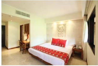
Deluxe Park View