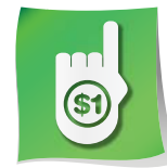
Covers from the First Dollar