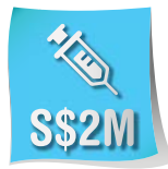
^ Overseas Medical Expenses Up To S$2,000,000 (Premier Plan)