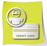
Fraudulent Credit Card Usage