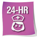
24-Hr Medical Assistance

Travel with ease of mind Travel Guard lets you travel the world in complete freedom, knowing you have the most comprehensive protection. Be it for a short business trip or extended family holiday, Per Trip or Annual Multi-Trip, you can choose your plan from the widest range of benefits and services.