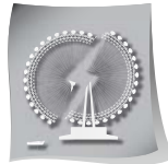
^ Disruption Benefits/Entertainment Tickets/Frequent Flyer Points