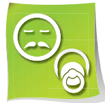
Covers All Ages