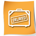
Loss & Delay of Baggage