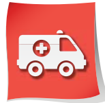
Unlimited Emergency Medical Evacuation (Superior & Premier Plan)