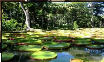
L' Aventure du Sucre Le Caudan Waterfront

USD 135 ADULTS / USD 95 CHILDREN (UNDER 12 YEARS OLD)